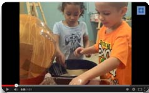
McKees Rocks Art Program