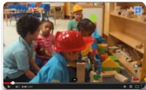
5th & Courtland Graduation